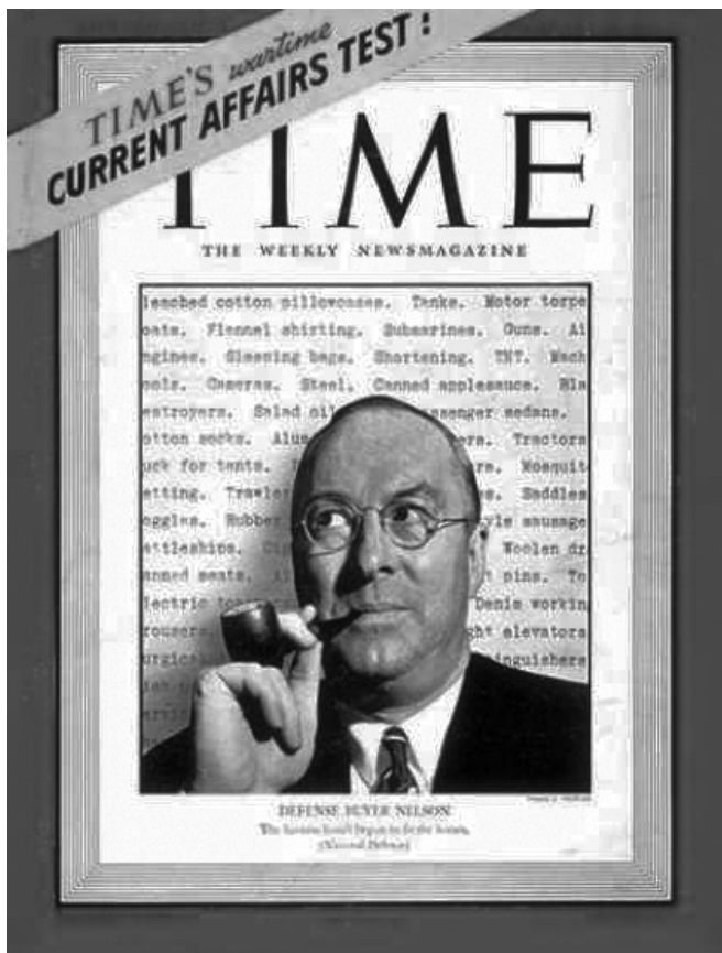
Donald M. Nelson, a former Sears Roebuck executive, became director of the War Production Board.

To help transform the civilian economy for the nation's defense, the WPB assigned priorities to allocate scarce materials, including rubber, steel, and aluminum, and worked with other agencies to control wages and prices. With its Order P-56A the WPB established a system of rankings or "ratings" so that orders would be